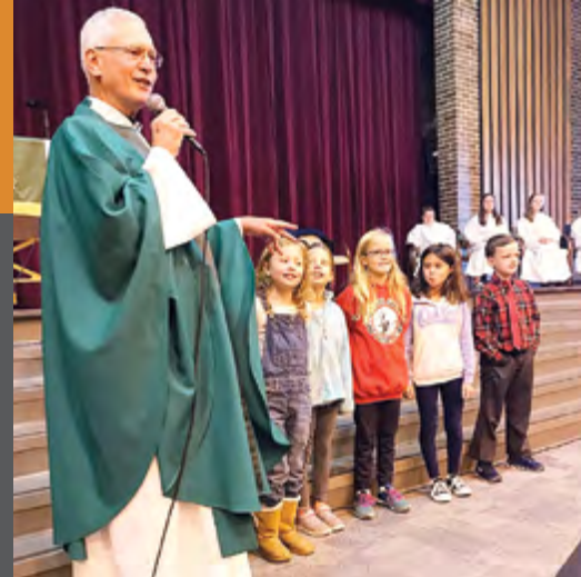
Our PSR students love celebrating the annual PSR teaching Mass!