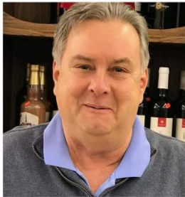
P J CONWAY COMMUNITY